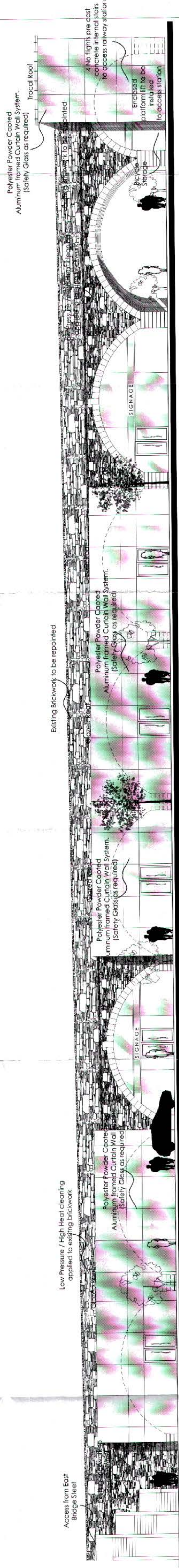
STEWART STREET ELEVATION